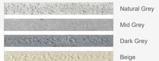
N.B. colours are indicative only