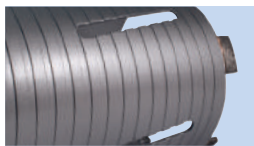
High quality slotted & fluted steel barrel for fast waste removal